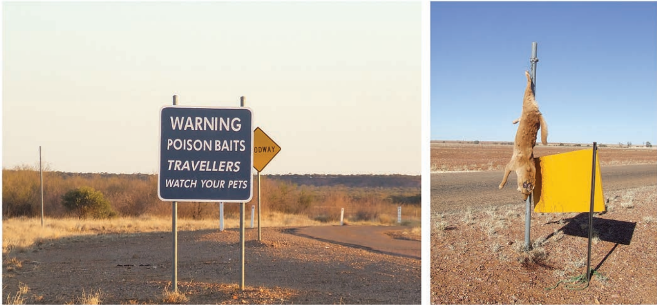
Fig. 1. —Dingoes ( Canis dingo ) are persecuted across Australia, primarily with poison-baiting (left panel), and they are also shot and scalped for bounties—and then displayed (right panel). Images from July 2015, highway in Boulia, Queensland.

One of the most significant welfare and ecological impacts of killing socially complex species, such as dingoes, is the disruption of their social groups (Haber 1996; Bryan et al. 2015). Dingoes live in extended families led by a single breeding pair. Packs act cooperatively to hold large territories, hunt, and rear offspring. The impact of lethal control extends beyond the individuals directly killed, harming surviving family members, and changing population structure and ecological function (Wallach et al. 2015). Importantly, killing of dingoes is often an ineffective and counterproductive approach to reducing livestock predation (Allen 2014). The breakdown of dingo social groups acts primarily to increase reproductive rates and immigration, due to the loss of reproductive suppression and territorial boundaries (Wallach et al. 2009). Under these conditions, all females can reproduce, primiparity tends to occur earlier, and dingoes can more easily immigrate into vacant territories (Wallach et al. 2015). Lethal control can therefore cause increases in both dingo population density (Wallach et al. 2009) and predation rates on livestock (Allen 2014).