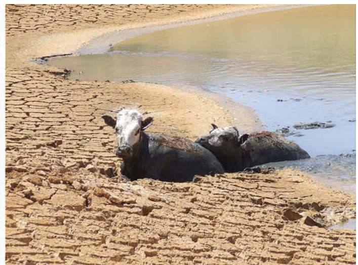
Fig. 4. —Dingoes ( Canis dingo ) were not the main cause of death for cattle on Evelyn Downs station, South Australia. Left, cow ( Bos taurus ) keeps a watchful eye on a young dingo at Evelyn Downs. Right, cows becoming bogged in a drying mud-silted dam at Evelyn Downs was the main cause of death. Apart from the 18 cows that died in silted dams, 4 wild donkeys ( Equus asinus ) were also killed. However, 9 cows (including those in the image), 2 wild donkeys, and 1 wild horse ( E. caballus ) were rescued (some more than once).