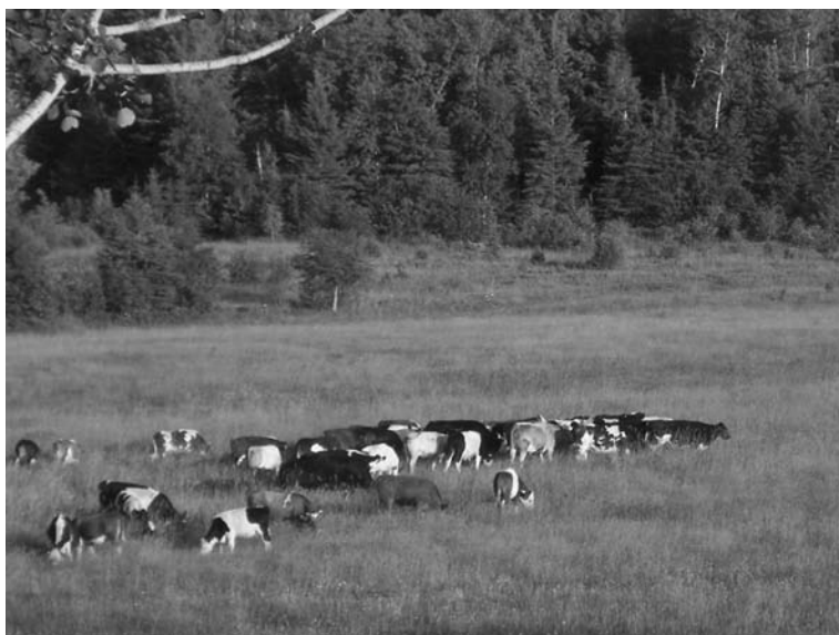
Figure 2. In the northern Great Lakes region of the United States, farm pastures are relatively small, confined grazing systems surrounded by forest. Livestock protection dogs can be fairly easily integrated into this type of grazing system.

Worldwide, there is some variation in how LPDs have been applied by producers relative to geography, the producer’s husbandry practices, and grazing situations. For example, in Sweden and the Great Lakes region of the United States, LPDs are often used in fenced pastures (figure 2; Levin 2005, Gehring et al. 2006, VerCauteren et al. 2008).