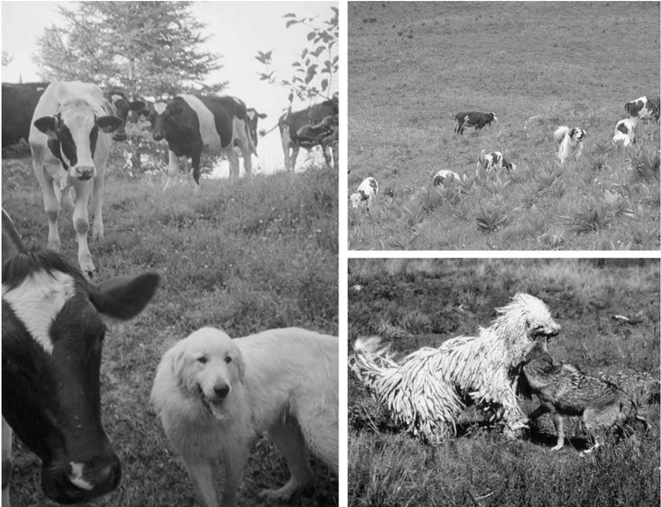
Figure 4. Effective livestock protection dogs display trustworthy, attentive, and protective behaviors.

protecting sheep and goats signify the approach's apparent effectiveness. Past reviews (e.g., Smith et al. 2000) and our research suggest that LPDs are established as effective protectors of sheep from coyotes. The broad application of LPDs for protecting livestock (including cattle) from wolves or wildlife-transmitted disease is much more tenuous and is a rich area for additional research. More rigorous research is needed to definitively assess the effectiveness of LPDs in preventing livestock depredations from wolves or reducing the risk of livestock contracting zoonotic diseases. Past studies of LPDs have been based mostly on surveys of producer attitudes relative to the effectiveness of dogs for reducing predation. Although these data are valuable, there remains a need for more science-based studies of the effectiveness of LPDs, sensu using a large-scale experimental design (Breck 2004). The few field studies that have tested the effectiveness of LPDs have had either small sample sizes or no true control (e.g., as in a before-after-control-impact design). In order for LPDs to be recommended more extensively by managers as a nonlethal management tool for reducing livestock losses due to predators (especially wolves) or wildlife