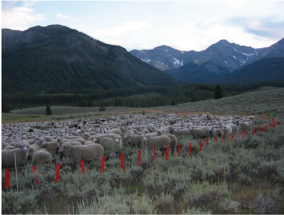
Fig. 3. —Lava Lake sheep in fladry.

There was a total of 240,000 sheep in Idaho in 2011 and, according to producer estimates, wolves killed 1,300 statewide (or 1 out of every 184 sheep statewide—United States Department of Agriculture – National Agricultural Statistics Service 2013). In 2012, there were 235,000 sheep in Idaho, and wolves reportedly killed an estimated 1,400 (or 1 out of every 167) sheep statewide. The National Agricultural Statistics Service reports on self-reported estimates obtained from producer surveys, which primarily represent unverified losses. However, they are the only measure beyond minimum confirmed depredations reported by state or federal agencies that provide even a rough estimate of total livestock losses. Statewide, 576 wolves were killed in response to livestock depredations from 2008 through 2014 (United States Fish and Wildlife Service et al. 2016).