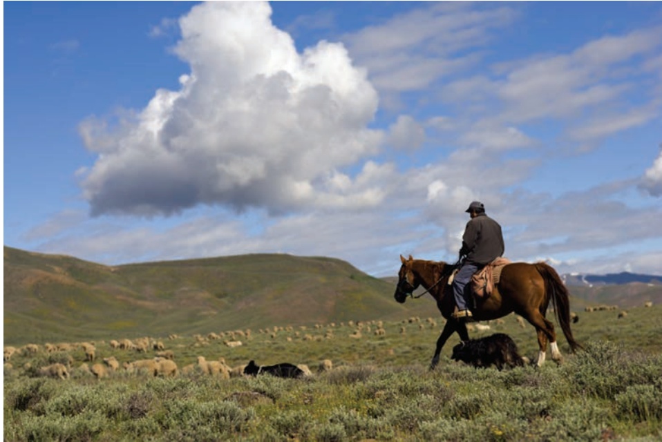
Fig. 1. —Lava Lake herder and herding dogs among the sheep.

unprotected areas, though the sheep are counted during shipping and at the end of the grazing season, which makes this scenario unlikely.