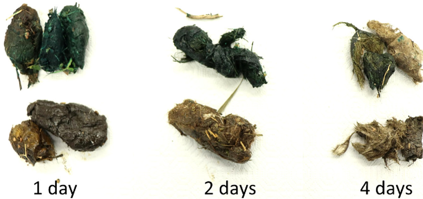
FIG 1 Use of food-grade dye (FD&C Blue No. 1 and 2; \leq 1\% of food mass consumed) facilitated intestinal transit time estimation in captive mountain lions ( Puma concolor ). Blue staining was visible in feces for 1 to 4 days after consumption of a bolus of dyed meat (top row), with intensity diminishing over time. Unstained feces collected at same time points are shown for comparison (bottom row).

samples gave 100% positive wells at the 10^{-5} and 10^{-6} dilutions of CWD brain homogenate and 50% positive wells at the 10^{-7} dilution, before becoming negative at the 10^{-8} dilution (Fig. 2A and B), suggesting that CWD prions were not sequestered by fecal homogenates or were unavailable to react in the RT-QuIC assay. We attempted to increase our sensitivity by testing fecal homogenates more concentrated than 10^{-3} ; unfortunately, we found complete inhibition of the RT-QuIC assay when testing 10^{-1} and 10^{-2} fecal homogenates (data not shown). This finding is not unique to our study,